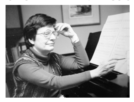
ACNMP National Award